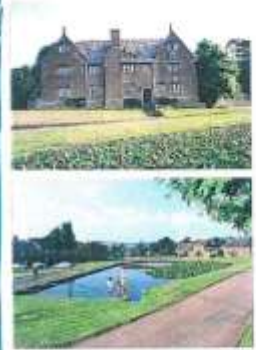
The gabled 17th century river stone stands at the head of the Green overlooking the village pond.

Warmington is an exceptionally attractive village set on a north-facing steep slope of the Edge ridge. There is a high degree of consistency in building form, colour and materials that emphasises the traditional qualities of the village. Most buildings are built of local riverstone, and few depart in height and small in scale. The most notable feature is the three-acre Green, complete with village pond, around which are many fine buildings. This area Warmington apart from many villages in the area. The remainder of the village follows the more usual pattern of narrow lanes, intimate groups of buildings and attractive vistas. Within the conservation area are several groups of fine mature trees, as well as numerous hedgerows that successfully soften built areas and massive development. The trees and hedges also complement stone garden walls in the central parts of the village together they define property boundaries.